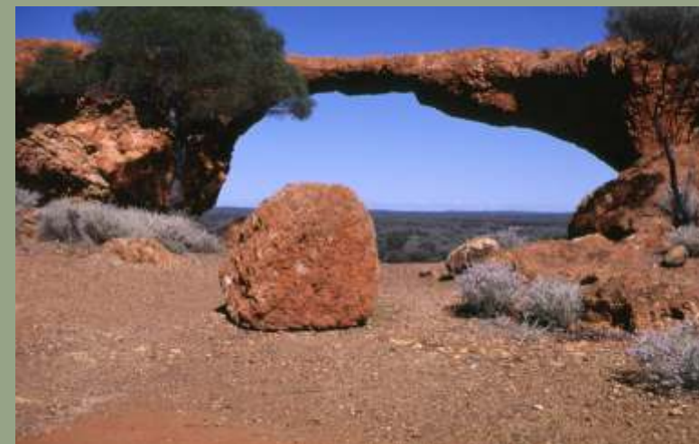
Erosional and weathering processes in action at Mt Magnet, WA

26 Dick Perry Avenue, Kensington (Technology Park, Perth) WA